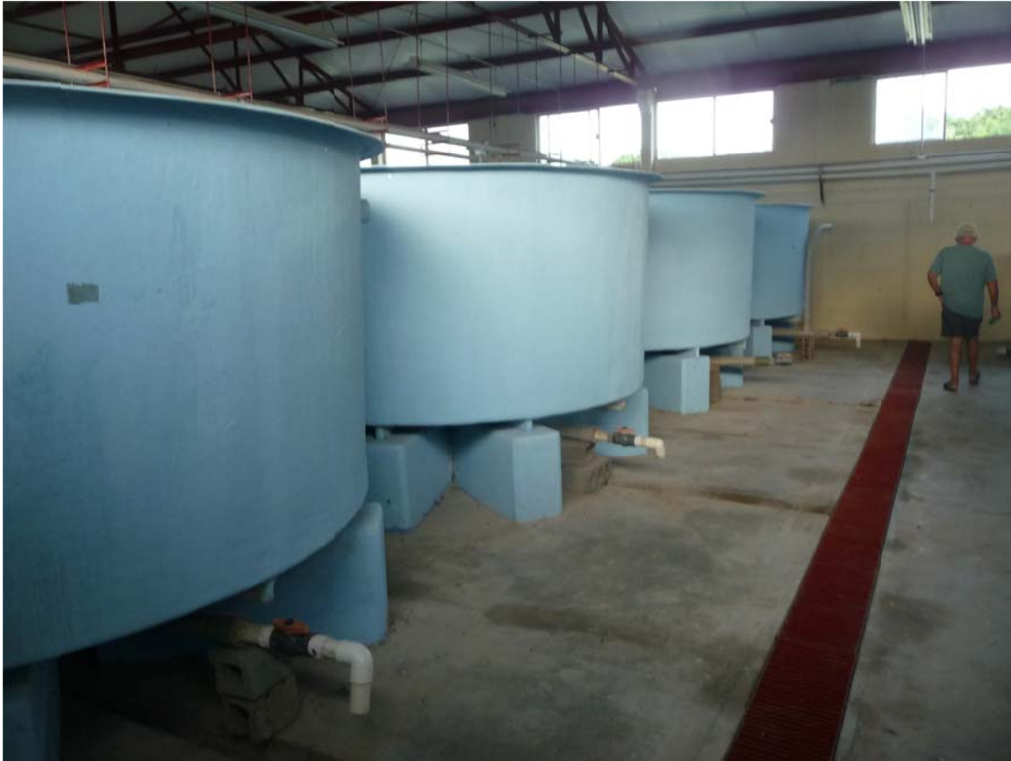
Four of the 12 foot round fish rearing tanks in Villahermosa

A newer building is being designed and constructed for a shellfish hatchery. This is a relatively large building (26,000 sq. m.) built on slab but without drains (a major flaw) . There are redundant saltwater supply lines and airline plumbed overhead, and most of the culture tanks and algae tanks have been purchased. A special algae room has been constructed and wired. We estimate that the facility had the capacity to produce about 10 to 15 million eyed-oyster larvae in any one 4 week period.