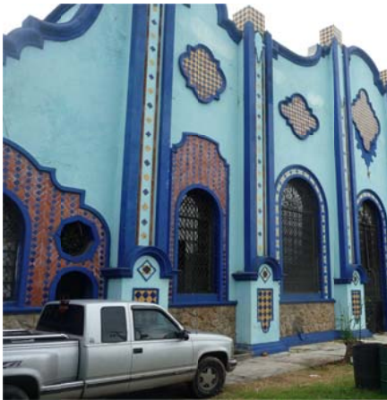
Old water treatment plant in Tancol, now the home of new UTMarT Aquaculture Learning Center