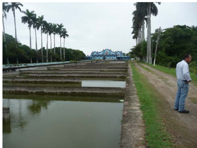
View of raceways with UTMarT's Hector Gojon in Tancol