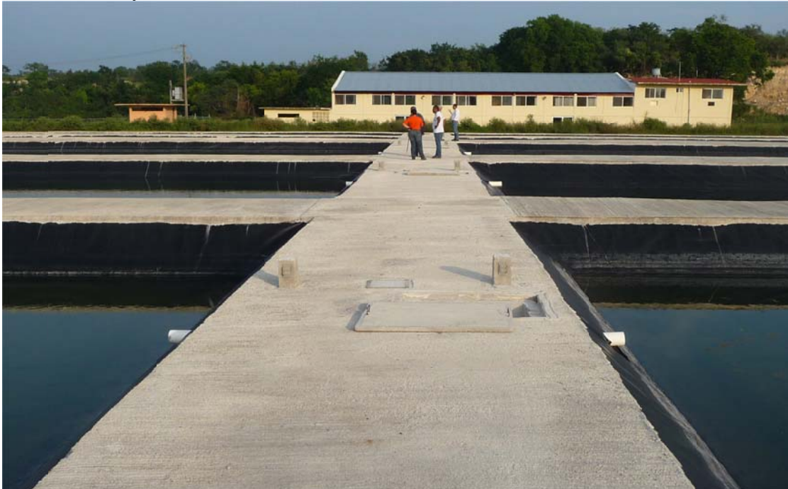
Large outdoor ponds (40 m x 15 m) complement indoor rearing facilities (rear) in Villahermosa

After lunch we visited Villahermosa, a formerly state-run aquaculture facility recently turned over to the University that is 20 minutes away up river from La Pesca. There are still some issues around access that haven't been worked out with the State but hopefully will be resolved by year's end according to Hector. Here there is a pumping station from the river that supplies extensive outdoor ponds (12 that were about 40m x 15m x 1.5 m deep). The pump intake can be selected to pump from deeper saltier estuarine water or shallower fresher water. The ponds were newly plastic lined with new concrete borders and had pond-side electricity outlets. In addition to fish culture, these ponds could be used as basins to settle sediments out of the water, storing salty water in advance of heavy rain events to supply the marine portions of operations, or for mass phytoplankton culture.. The pumps also supply two indoor facilities and water may be sand-filtered and treated with UV. The larger older indoor facility will be dedicated to fish culture, and has 12 large (3m round) fiberglass tanks, some smaller tanks, and an algae culture room. The facility had been used in the past for catfish, freshwater shrimp Macrobrachium , freshwater crayfish Cherax .