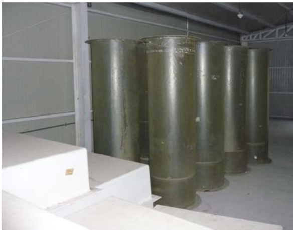
Microalgae tanks (background) and broodstock tanks.

A newer building is being designed and constructed for a shellfish hatchery. This is a relatively large building (26,000 sq. m.) built on slab but without drains (a major flaw) . There are redundant saltwater supply lines and airline plumbed overhead, and most of the culture tanks and algae tanks have been purchased. A special algae room has been constructed and wired. We estimate that the facility had the capacity to produce about 10 to 15 million eyed-oyster larvae in any one 4 week period.