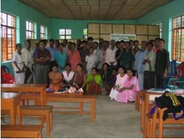
A group photo of participants and trainers