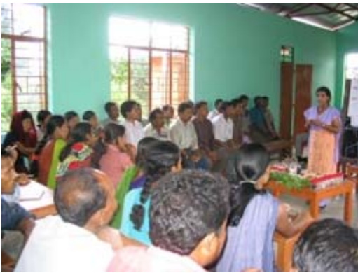
Participants in the Bishramganj-INDIA AwF Project receiving their initial instruction