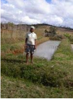
Small-scale aquaculture systems can be very extensive, such as small ponds used in seed production enterprises (Madagascar)