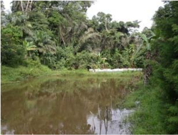
Small-scale systems can very extensively managed and in the forest zone have native vegetation encroaching closely on the levees