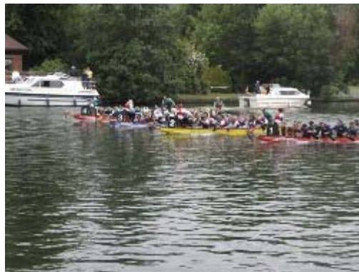
The AwF crew in the final (dragon boat # 1)