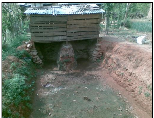
Fig 6. Fish with pig