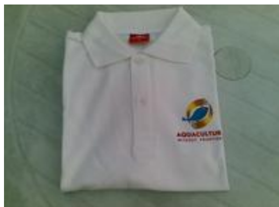
Fig. 9 AwF-T shirts for fund raising (Price US$30)

Ram plans to sell these T-shirts during the World Aquaculture conference during September 13-15, 2010 in Phuket, Thailand organized by FAO/NACA.