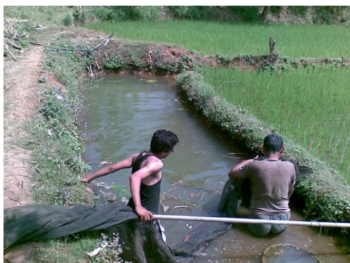
Fig 2. Fish harvesting during the visit

screen. This is to help farmers generate more income in addition to the income from fish farming as a part of livelihood improvement.