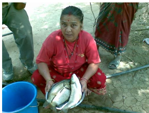
Fig 3. Just harvested fish