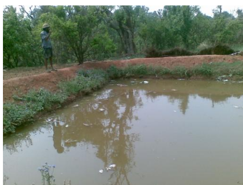
Fig 5. One of the well managed ponds