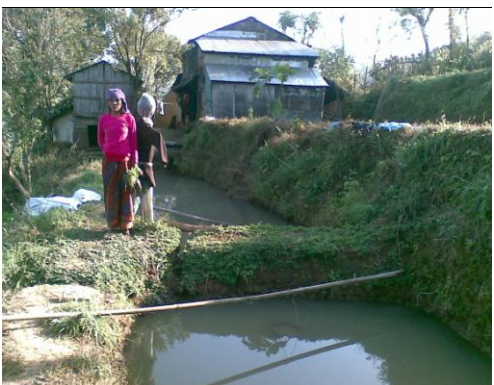
Fig 7. Two families farming together