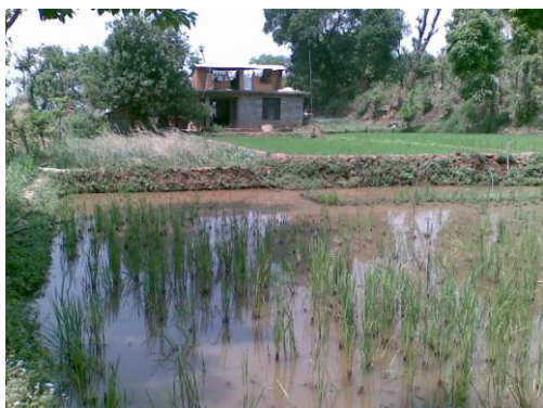
Fig 4. Ditch at the corner of Rice plot