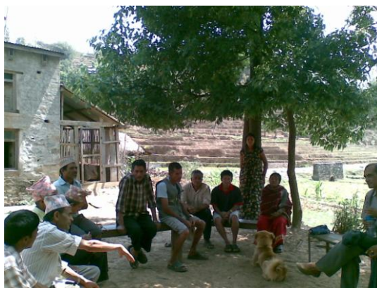
Fig. 8 Meeting with farmers

fish farming in Nepal and the purpose of the program. Similarly, other Team members gave brief activities done in previous project site i.e. Rainas Tar. Several questions were raised by the locals and they were answered. At the end of the discussion of more than two hours, names of 20 family heads were prepared as given by the people gathered for the meeting. A Chair was also appointed among themselves who will be the person contact with the Project Team.