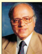
Prof. M.S. Swaminathan