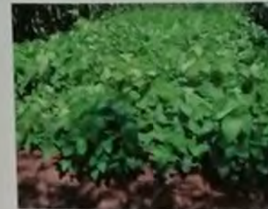
Soya Value Chain

“Benefit from Technical Expertise Through the Farmer-to-Farmer Program”