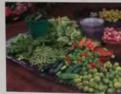
Horticulture Value Chain

“Zitsanzo za ulangizi wapamwamba kudzera mu mavolunteer a Farmer-to-Farmer”