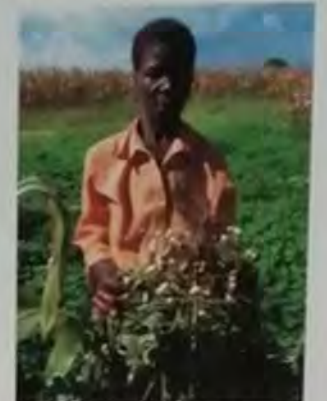
Groundnut Value Chain