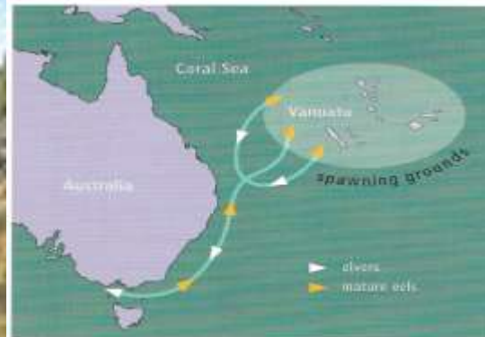
Figure 2: Migratory routes of short-finned eels between Australia and the South Pacific