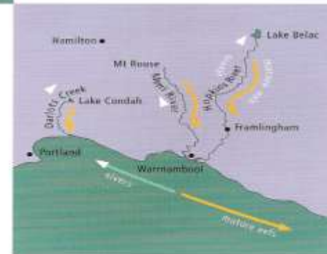
Figure 3: Migratory routes of short-finned eels within South-west Victoria