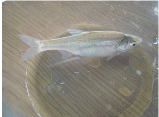
Mola (Mola carplet)

These are indigenous Small fishes targeted for conservation