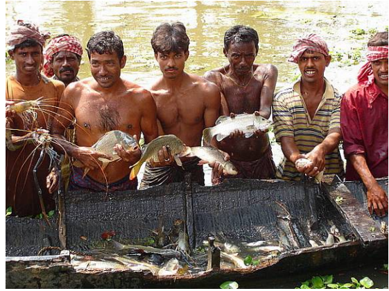
Proud Fish Farmers