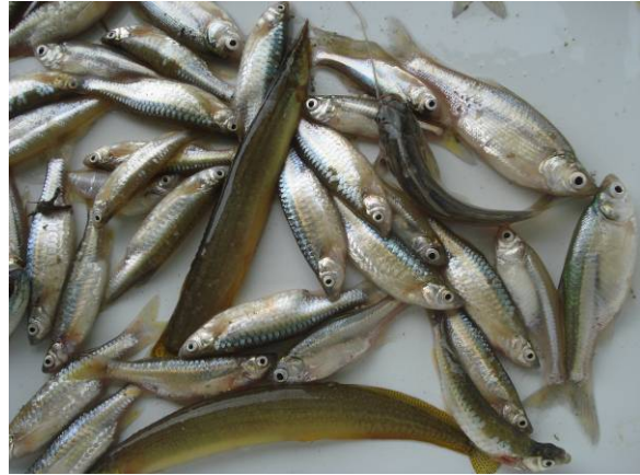
Puti, Morala & Ban (Barbs, eels, mola carplet)