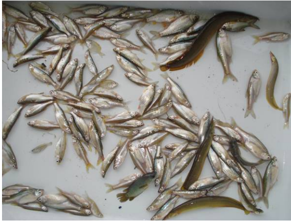
Puti ( Barbs)