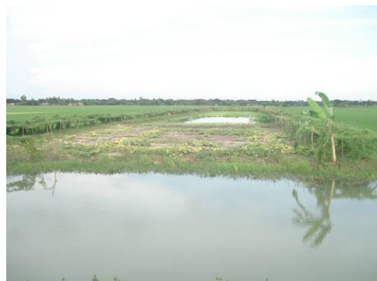
Vegetable Cultivation on the pond side