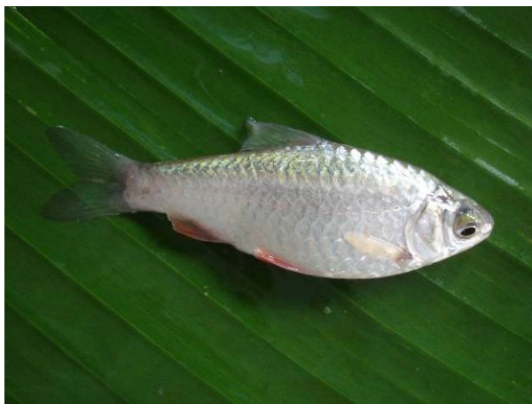
Sar Puti Indian swamp barb)