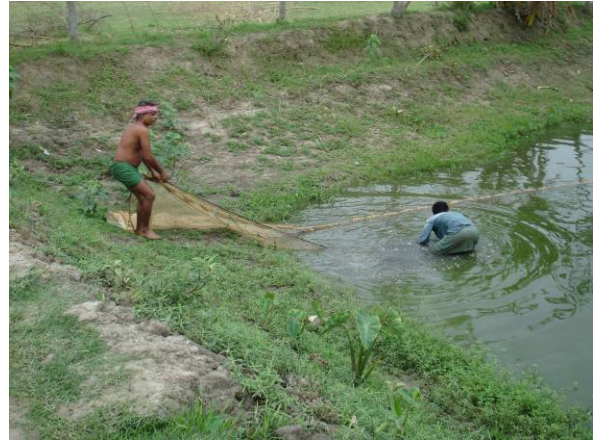
Catching of Fish from their pond