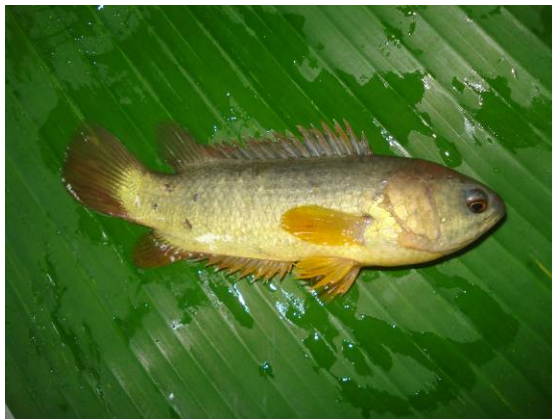
Koi (Climbing perch)