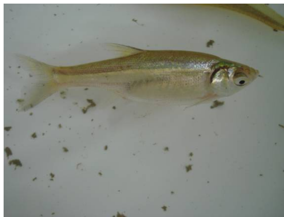
Mola (Mola carplet)