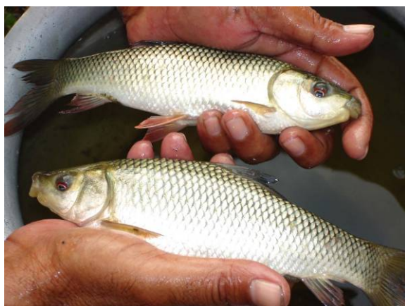
Fish ready for sale