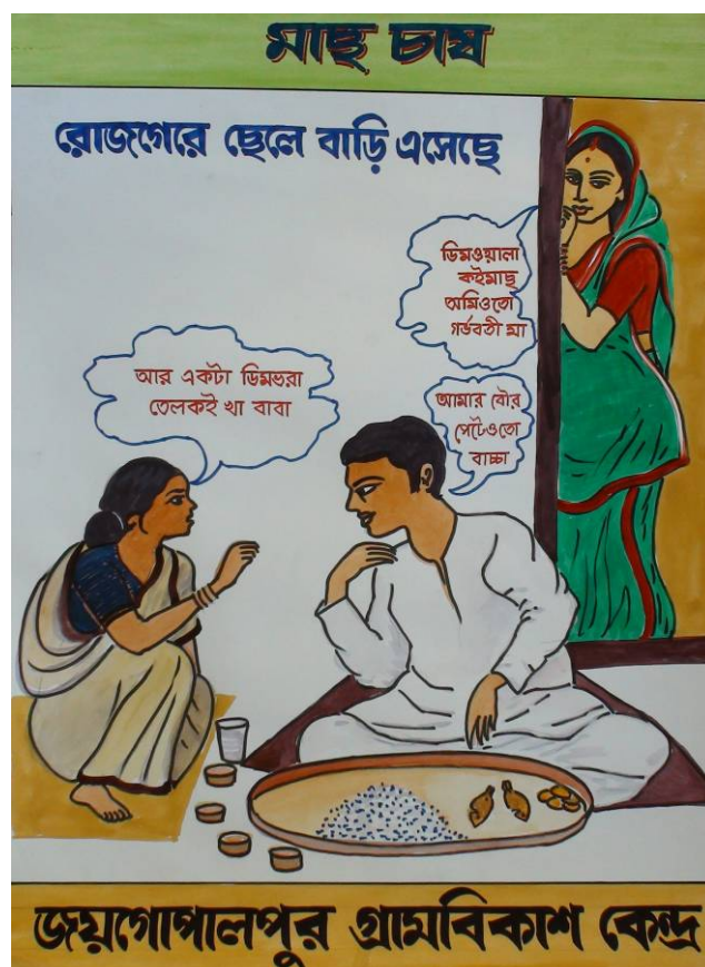
Posters developed and being used in the Campaign for Protection, Preservation and cultivation of Local small fishes