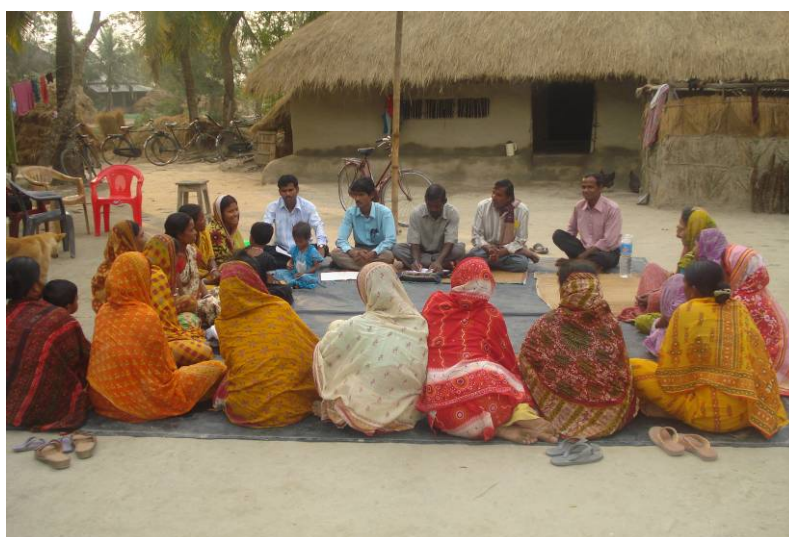
Training of JGVK Staff, Farmers and SHG Women