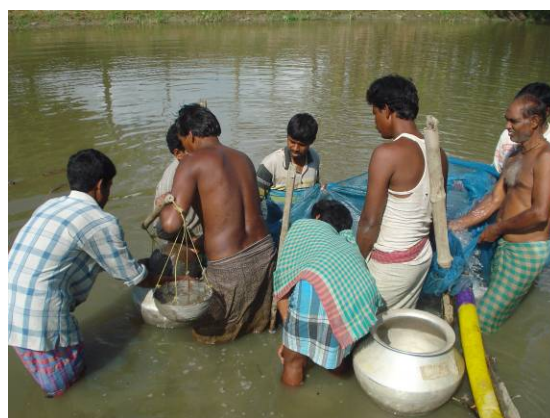
Fingerlings sold from Nursery Pond