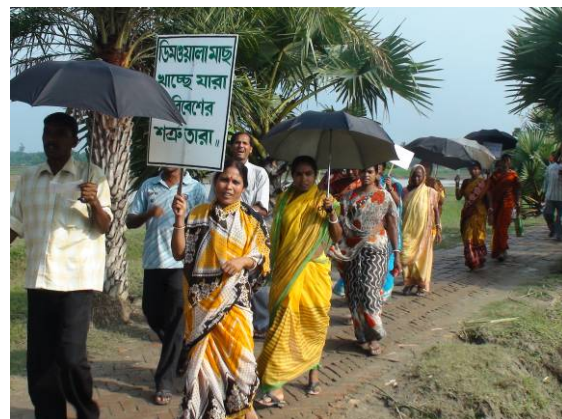
Campaign for Preservation of Small Local fishes by people, mostly women.