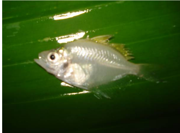
Chanda ( Indian glass fish)