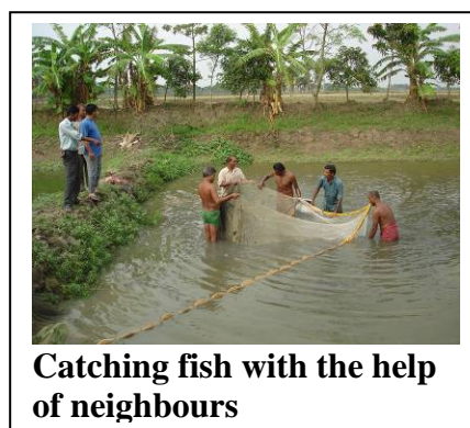
Catching fish with the help of neighbours

** Mocha (prawn, Macrobrachium Rosenbergil ) each mocha having 10-15 gram weight