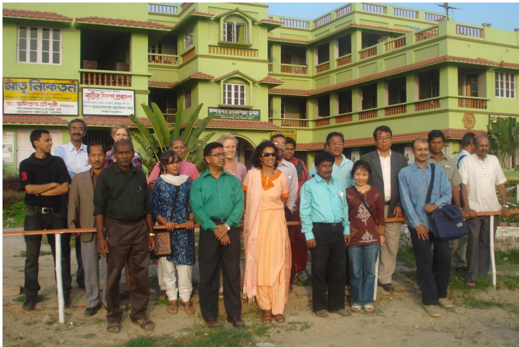
Participants of International Workshop visited JGVK's hatchery, demonstration farm and extension activities on February 23 rd , 2010