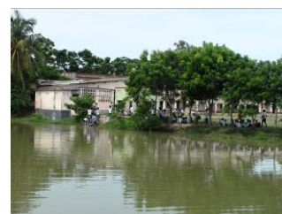
Students wash their plates in the pond after their mid day meal

Mr. Paramanik also did a comparative study of growth of fish production in the two ponds. The pond located close to the school having: (i) less depth (ii) less number of fingerlings (iii) everyday provided feed. In addition, students after their mid-day meal wash their plates in this pond. Thus fishes are getting extra feed in the form of rice, vegetables (iv) the initiative of Headmaster, committee members and collaboration with JGVK develop local community resources productive and create a good example before the community.