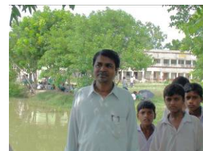
Head teacher explaining the process of fish farming in the school ponds

The school is located very close to (within one km.) JGVK office. The school has two big ponds having water area of approximately 0.50 and 0.55 acre. Since last 20-22 years, the school committee leased out these two ponds to outside farmers at a rate of Rs.2-3000 / year.