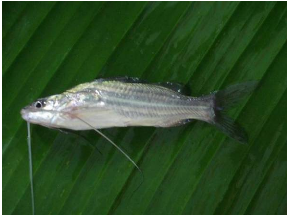
Tangra ( gangetic mystus)