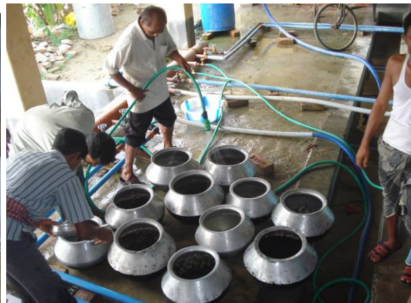
Hatching and follow-up activities