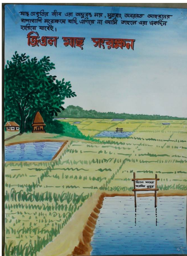
Posters developed and being used in the Campaign for Protection, Preservation and cultivation of Local small fishes