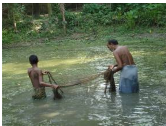
Netting for removal of excess duckweeds

The details on stoking, harvesting, expenditure and income were stated below: