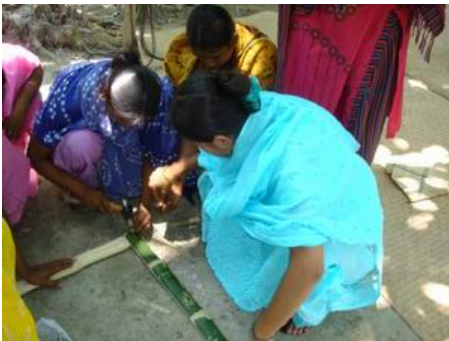
Figure 4. Cage frame construction from split bamboo