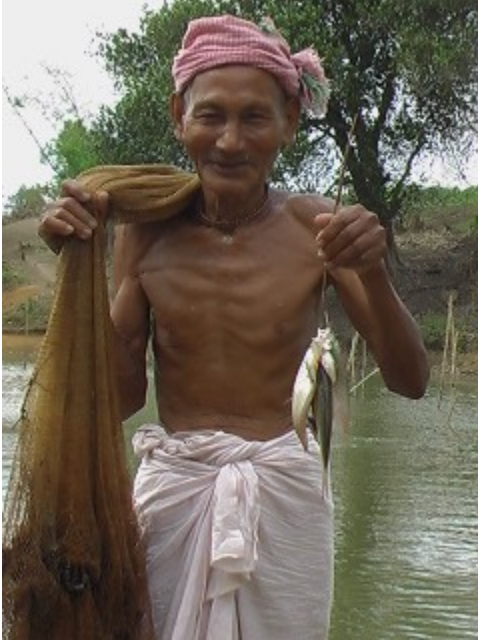
Figure 25. Farmers have been using pond-grown fish for family consumption