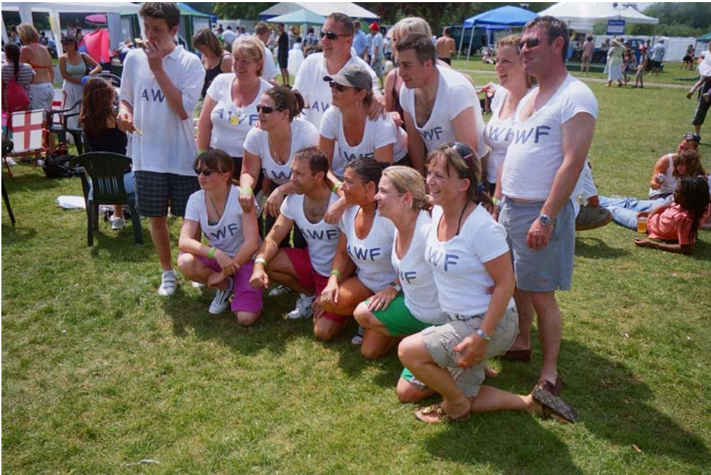
Figure 31. Though not on our volunteer aquaculture database, these people are great volunteers!

AwF expresses sincere thanks to the 22 crew members and to all those kind people who sponsored them for AwF.