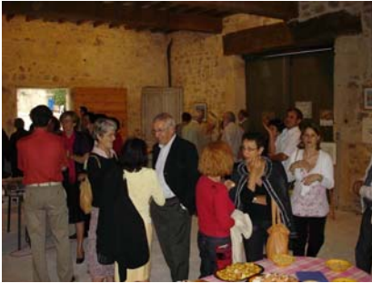
Figure 15. Another general view of the exposition