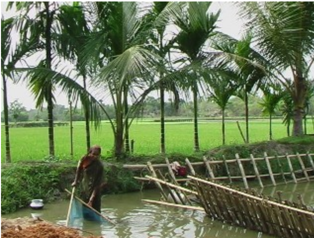
Figure 24. Women catch fish as well as cooking those harvested