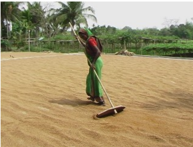
Figure 18. Rice is an important cultivated crop; women are heavily involved in post-harvest activities