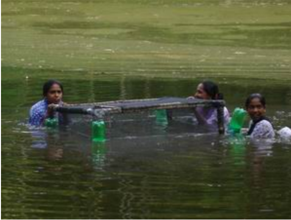
Figure 8. Placing the cage in the pond