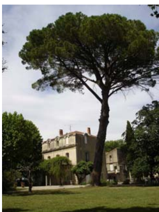
Figure 13. Château Les Mazes (the site of the exposition)