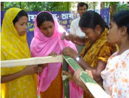
Figure 5. Cage frame construction from split bamboo