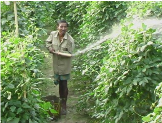
Figure 21. Pesticide usage for horticultural crops is also increasing; AwF will try to minimize this in phase 2