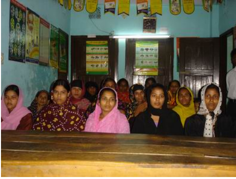
Figure 2. Trainees in Nalcity