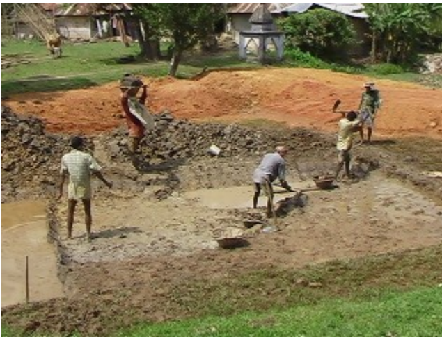
Figure 16. The dry season is the best time for digging ponds - no JCBs in small-scale aquaculture!