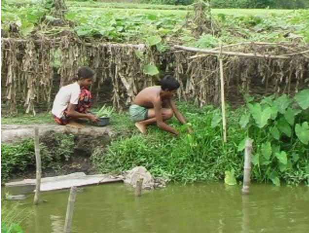
Figure 20. The integration of horticulture and fish culture is increasing