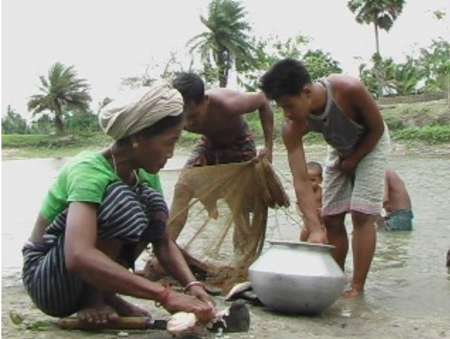
Figure 23. While father and sons are catching fish, mother prepares a fish for cooking