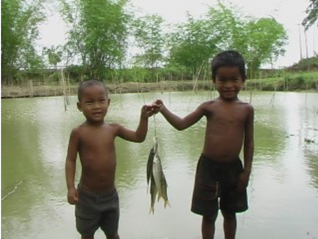
Figure 17. Children are showing a great interest in fish culture; it's an attractive activity