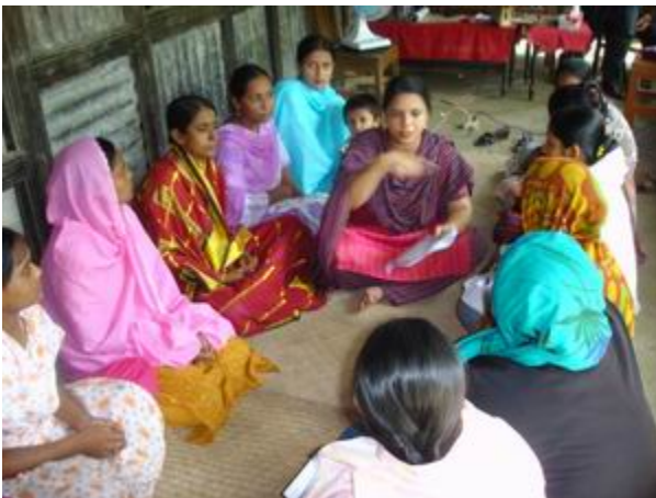
Figure 10. Technical discussion session