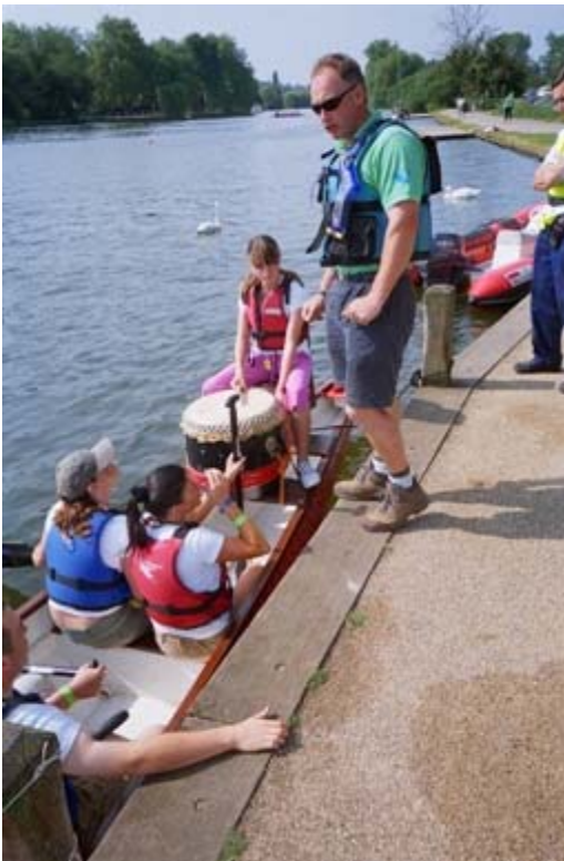
Figure 29. One of the two AwF crews preparing.....

Although the two sponsored dragon boat crews racing for AwF in Marlow, England yesterday did not do so well competitively as last year, the important thing for AwF is that preliminary figures indicate that they will have raised more funds for us than in a similar event in 2005. We will post more details and photos later; meanwhile, here are a couple of examples: