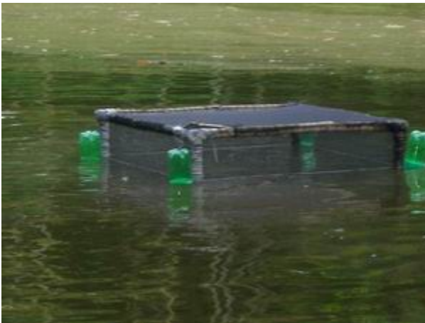
Figure 9. A simple and cheap floating cage