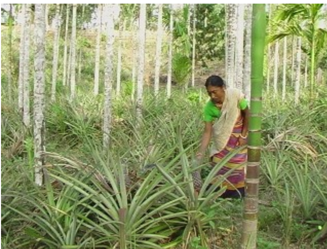
Figure 19. Pineapple is also a major fruit crop in the region and its cultivation is a major activity for women