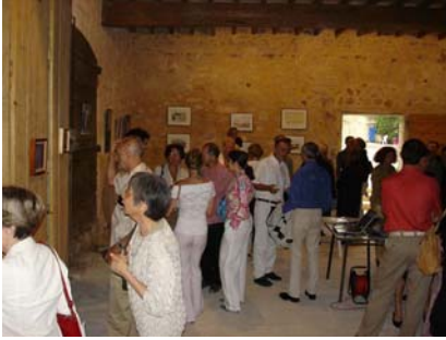
Figure 14. General view of the exposition