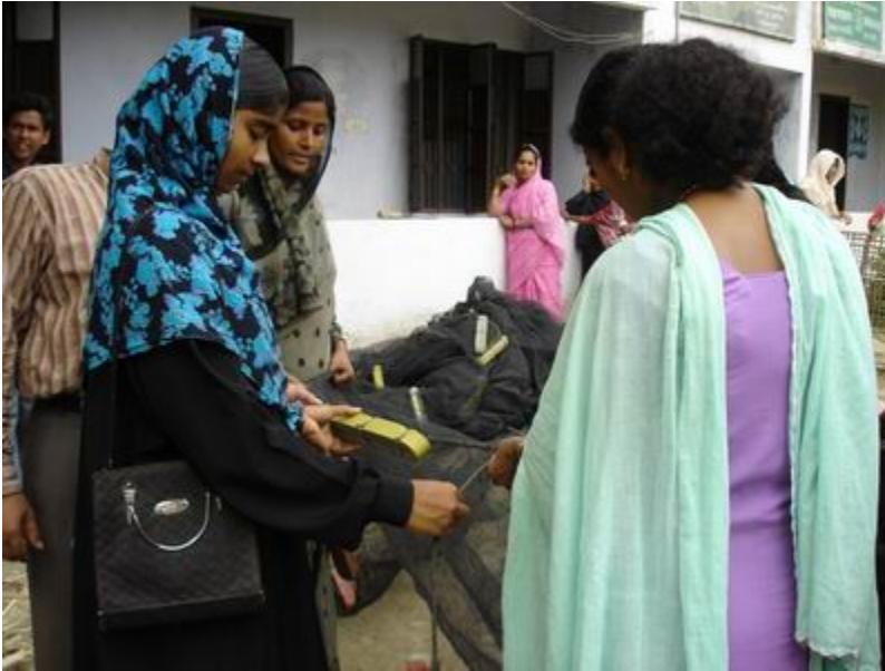
Figure 6. Cutting netting for cage construction