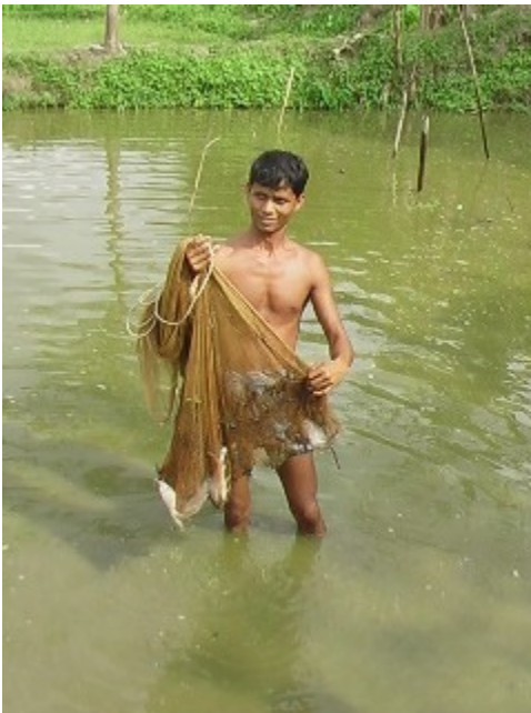
Figure 26. Young people are finding aquaculture an income-generating activity