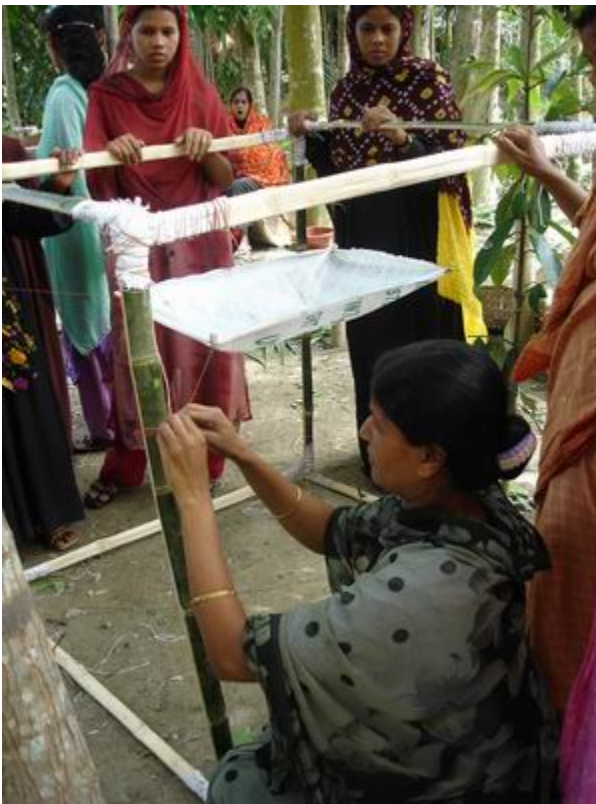
Figure 7. Placing the feeding tray in a cage