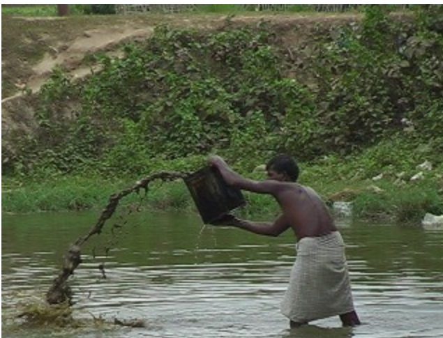
Figure 22. Prior to harvesting by net, this farmer is giving feed to attract the fish to one side of the pond