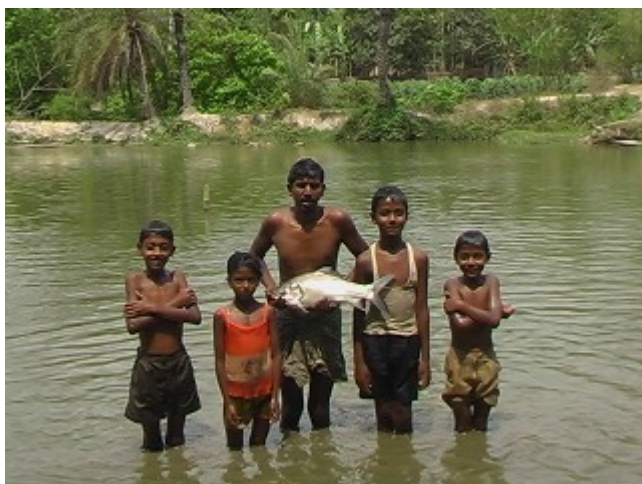
Figure 27. A farmer proudly displays a catla (one of the Indian major carps) harvested from his pond