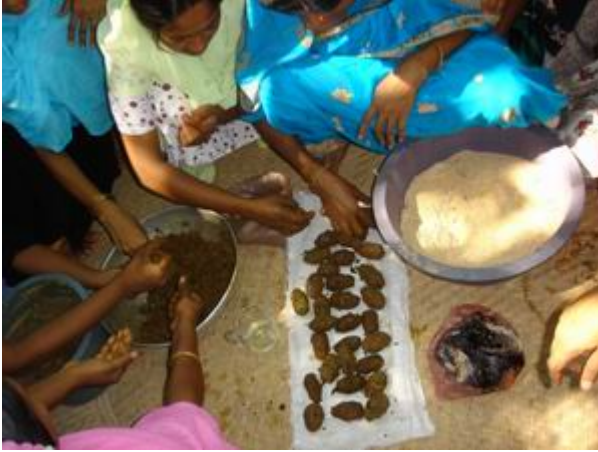
Figure 11. Making fish feed by hand