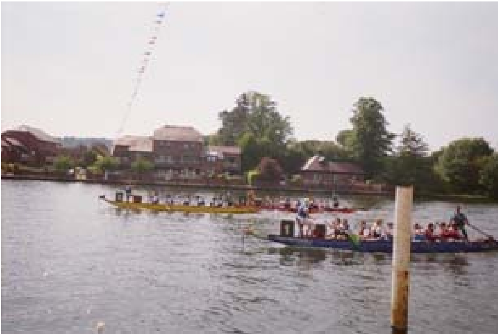
Figure 30. Winning the first heat.....